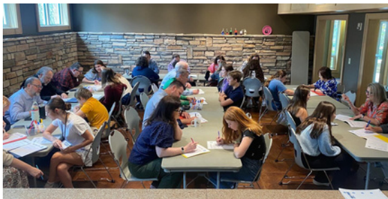
2025 Confirmation Class and Mentors

Annunciation Greek Orthodox Church 1100 Napa Valley Drive Little Rock, AR 72211 Worship @ 10:00-11:30AM