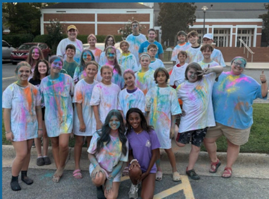
Color Run + Capture the Flag 8/25

Our Youth are following two different styles of Christian Education this fall. The Sunday School classes are following Feasting on the Word's lectionary based lessons to grow their biblical knowledge. Our Youth Group is taking a journey through faith as we compare the experiences on a road trip to the discovery of faith in Christ.