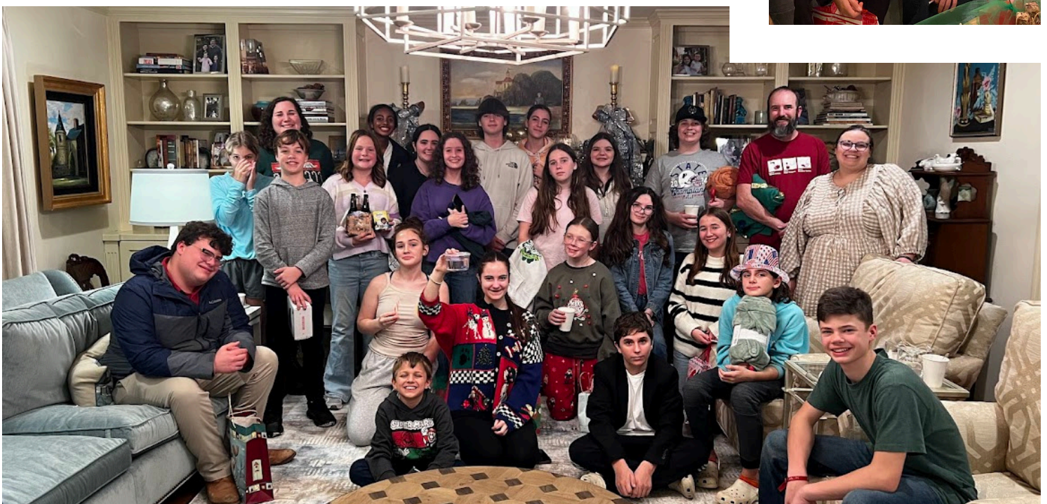
Youth Progressive Christmas Dinner Party December 2024